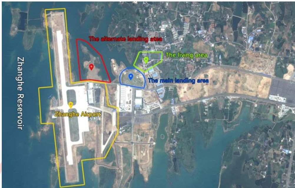
(show as on Google map)