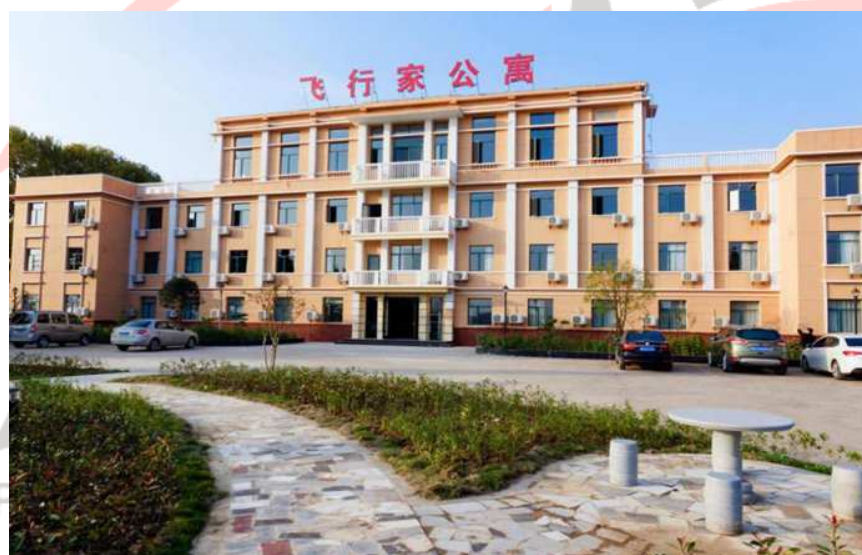
(Outside view of the apartment)