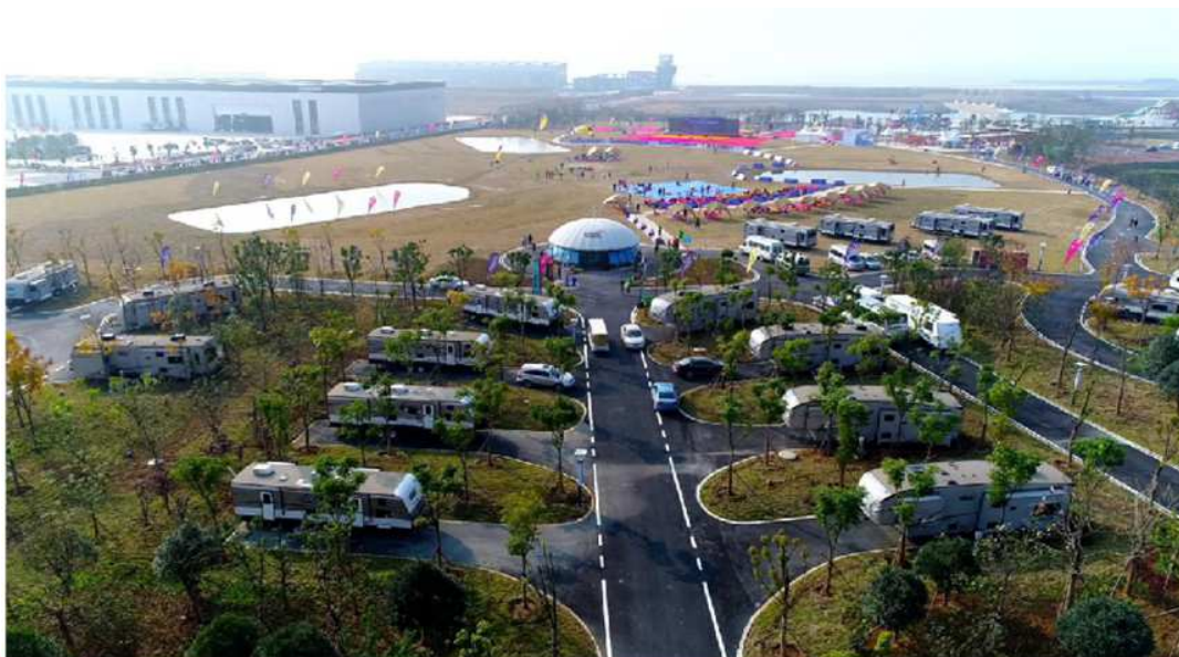
(Aerial View of the RV campsite)