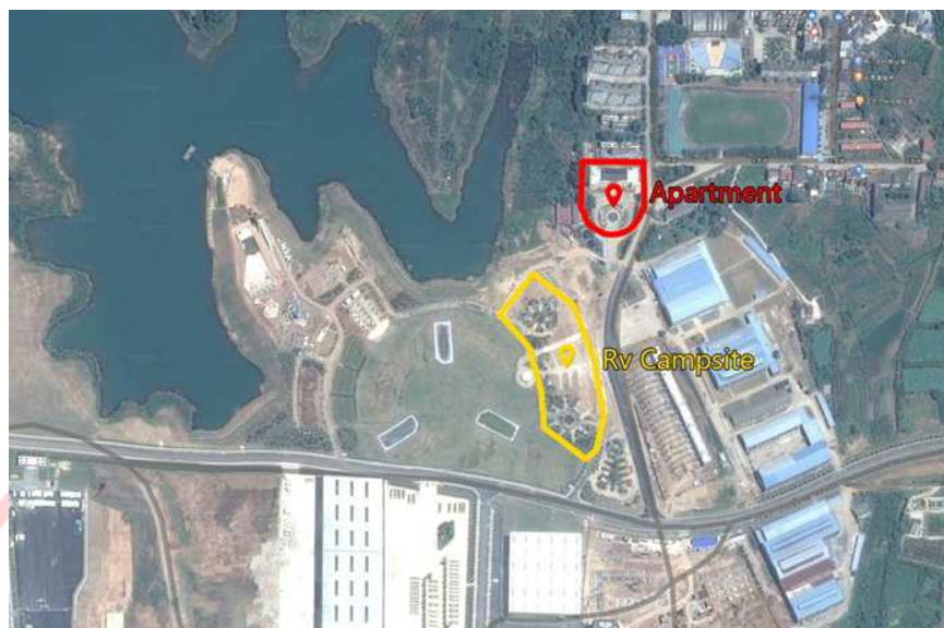
(Shown as google map)